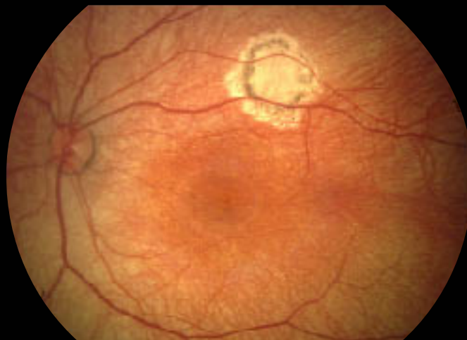
80 degree High Contrast Image of Pediatric Retina - Retinoblastoma