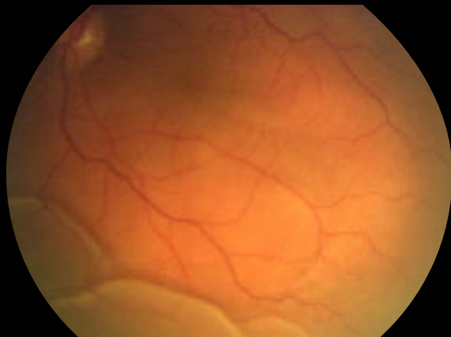
80 degree High Contrast Image of Adult Retina